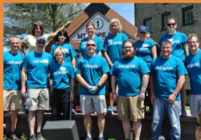
Community volunteers at the 2016 Day of Caring

Bivona volunteers dedicate thousands of hours each year to help our children. We could not do the important work we do without them. Depending on the amount