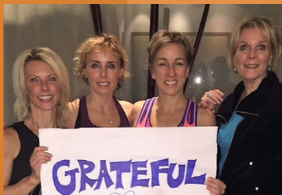
2016 Midtown Thanksgiving Yoga Event

Support Bivona by hosting your own event! You will help raise awareness about child sexual and physical abuse, and your support will help Bivona provide critical