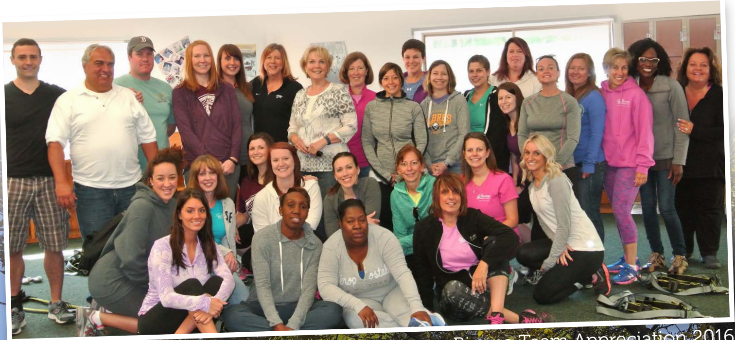
Bivona Team Appreciation 2016